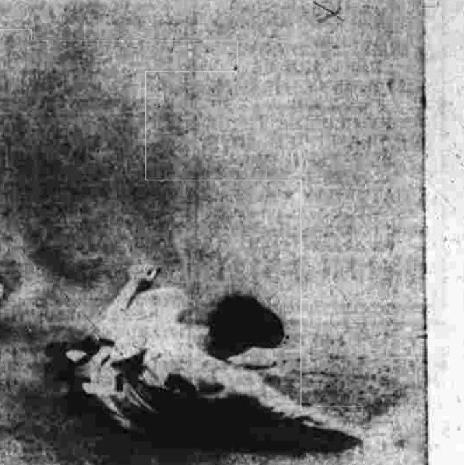
Campanella in batting stance.